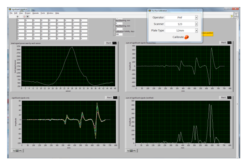
Figure 2: TruFlux 12mm Plate Calibration Signals